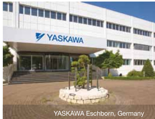
YASKAWA Eschborn, Germany

VIPA has also recently become part of the company. This means that YASKAWA can now supply PLCs, HMIs and I/O components from a single source.